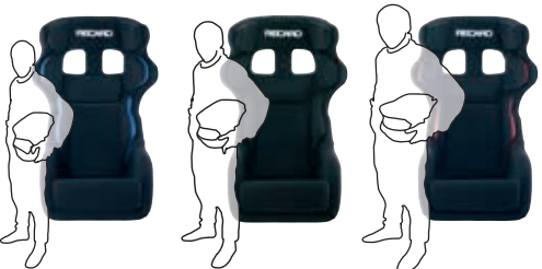
Pad Kit S, M, L