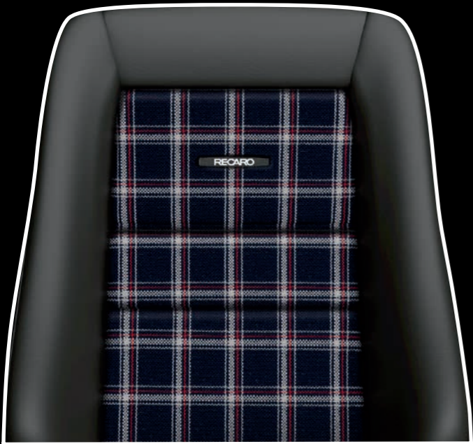
Black leather/classic checkered fabric