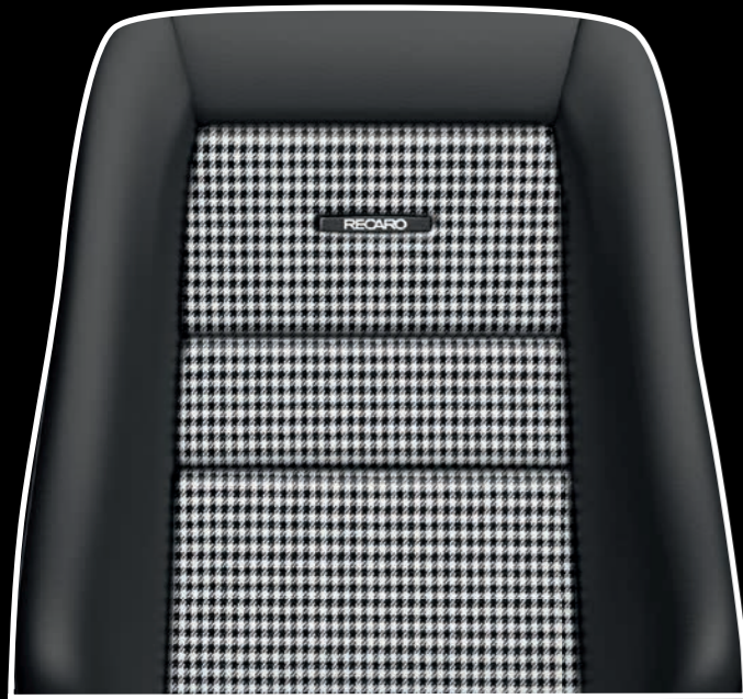
Black leather/Pepita fabric