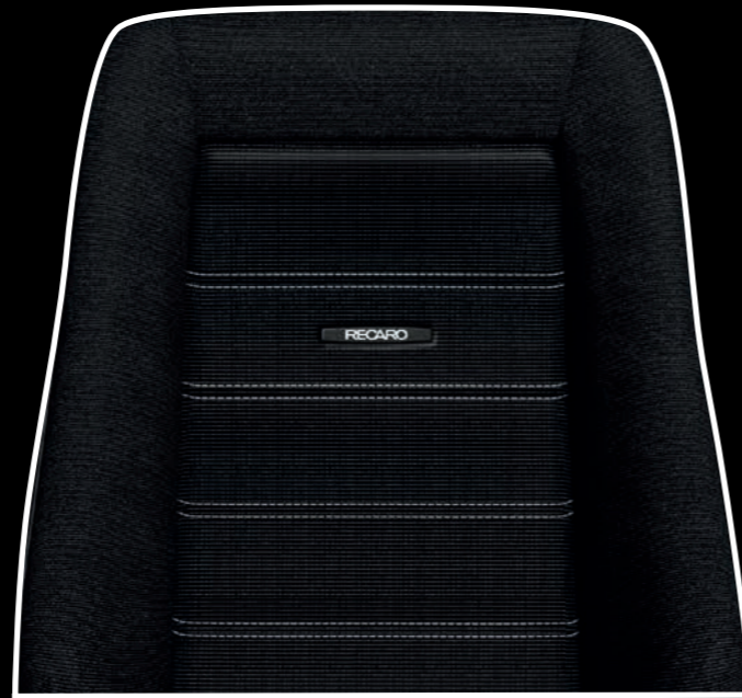
Black leather/classic corduroy